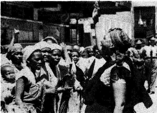
South African women demonstrating against apartheid's Pass laws (1958)

JUST AS THE AFRICAN DIASPORA meant not only South Africa but South USA, and Black meant not only Africa — South, West, East and North — but also Latin America, including the Caribbean, so Black Consciousness, plunging into the struggle for freedom from Western imperialism did not stop at the economic level anymore than did the East European freedom fighters struggling against Russian totalitarianism calling itself Communism. By no means did this signify a forgetting of the economic impoverishment of the masses; while man does not live by bread alone, he must have bread to live.