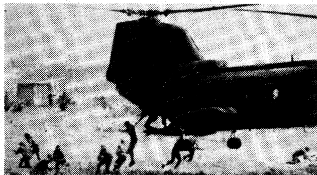
U.S. Marines in Lebanon

It has been the refusal of Gemayel to have any genuine "power sharing," or to institute any reform in the National Covenant from 1943 — one that institutionalizes Phalangist minority power and which led to the Civil War of 1975-76 — that brings together non-Phalangist Maronites together with Druse, Shiites and Sunnis.