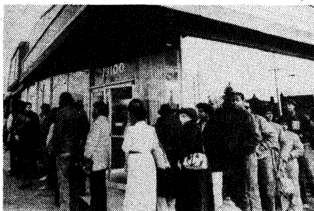
Nearly 500 people waited in line to apply for 20 minimum-wage jobs at a Detroit store not opening till Spring.

You wonder what is going to happen to our pension fund, our union, our job, if things go on this way. — CTA worker