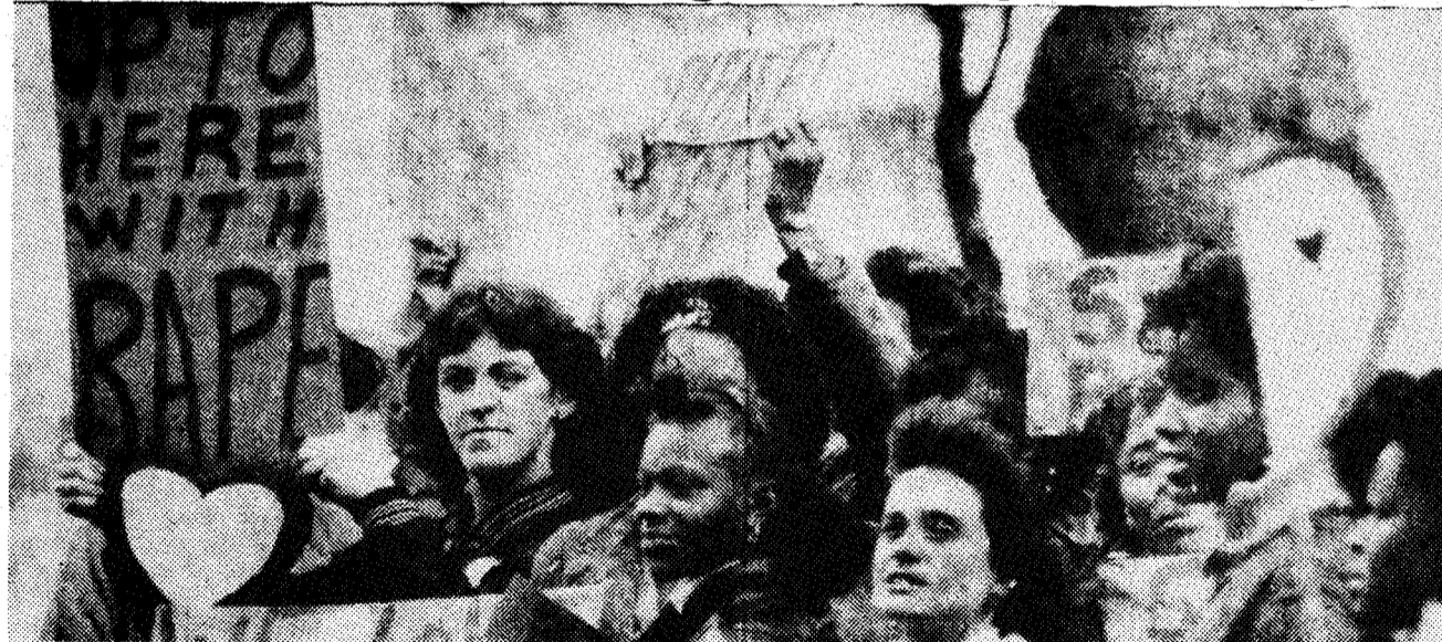
Anti-rape demonstrators gather in Detroit's Kennedy-Square on Feb. 14.

Detroit, Mich. — Black women in neighborhoods throughout the city have formed community action groups in response to the growing number of rapes of Detroit schoolgirls — 47 confirmed sexual assaults since September. These groups have blasted police and city officials both for the "conspiracy of silence" which kept the community unaware of the "epidemic" of schoolgirl rapes and for officials' callousness and indifference toward the problem itself once it came to public attention.