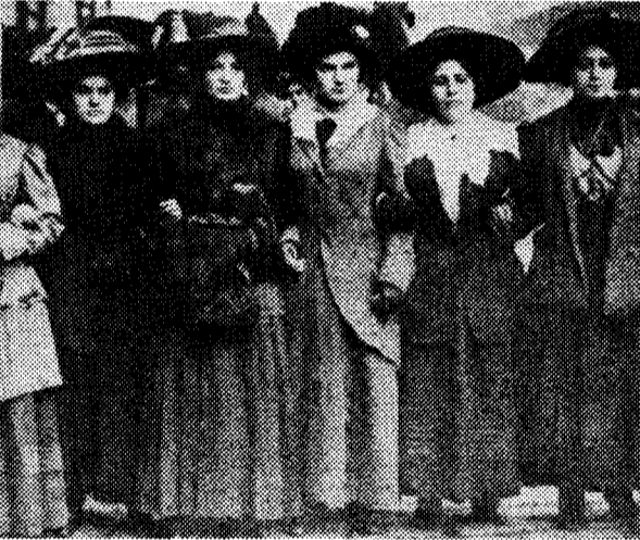
Shirtwaist strikers marching on New York's City Hall in the "Uprising of the 20,000" in 1909.

The month of March is rich in women's history. March 5 marks the birth in 1871 of the revolutionary Rosa Luxemburg. March 8 is the celebration of International Women's Day, which was first proposed in 1910 as a tribute to the struggles of American women garment workers, and March 25, 1911 was the date of the infamous Triangle Shirtwaist Fire in which 146 garment workers were killed.