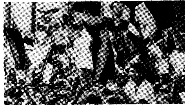
Nicaragua in revolution commemorating 50th anniversary of death of Augusto Cesar Sandino

The mass revolutionary movement that most sticks in Reagan's throat is Nicaragua's, for there a people have rid themselves of 40 years of dictatorship — the U.S. propped-up Somoza dynasty. That revolution has made modest gains,