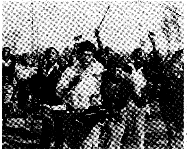
Soweto youth in rebellion (1976)

that murdered Maurice Bishop came from his co-leaders in the Party, led by Coard and Austin. Nor can anyone skip over the infantilism of making the point of debate a question of Maximum Leader vs. collective leadership and "leadership method," instead of the dialectics of revolution and the question of which road to take out of the crisis in their country, a crisis determined by the myriad world crises.